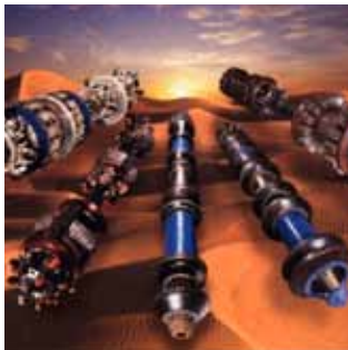
Left: Magnetic flux and Ultrasonic pigs Below: Magnetic flux pig