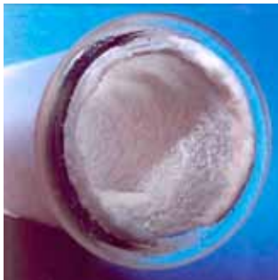
Left: Hydrate formation in a pipeline